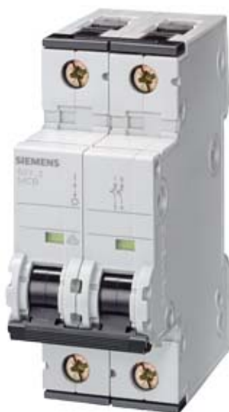
CIRCUIT BREAKER 400V 6KA, 2-POLE, D, 10A, D=70MM