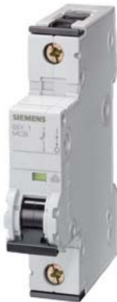
CIRCUIT BREAKER CURR. SENS DC 220V AC 230/400V 10KA, 1-POLE, C, 40A