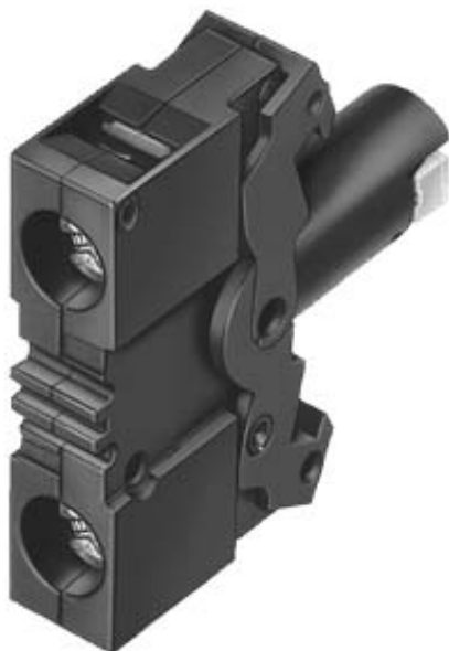
ACTUATOR-/INDICATOR COMPONENT WITH INTEGRATED LED 230V AC LAMP HOLDER SCREW TERMINAL RED