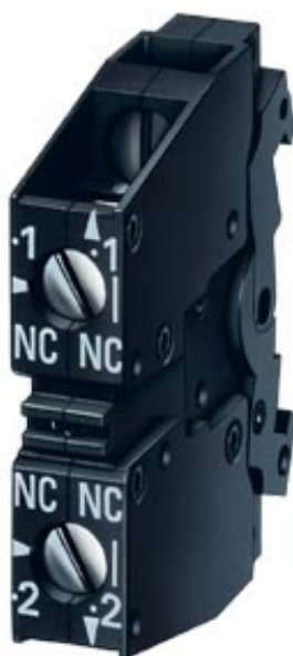
ACTUATOR-/INDICATOR COMPONENT CONTACT BLOCK WITH 2 CONTACTS SCREW TERMINAL, 1NO+1NC