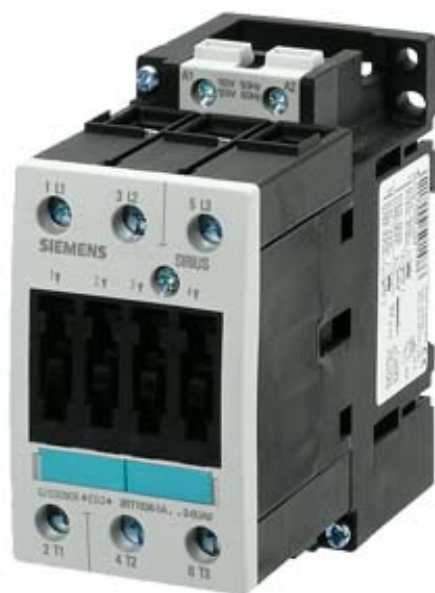
CONTACTOR, AC-3 15 KW/400 V, DC 110 V, 3-POLE, SIZE S2, SCREW CONNECTION