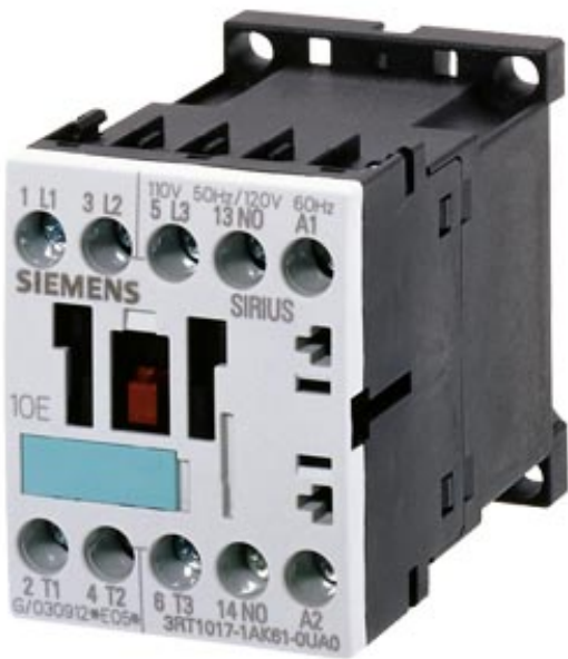
CONTACTOR, AC-3 4 KW/400 V, 1 NC, DC 110 V, 3-POLE, SIZE S00, SCREW CONNECTION